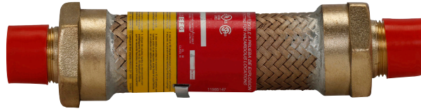
ECGJH (male connections at both ends) (shown furnished with protective caps)