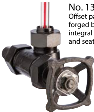
No. 136 Offset pattern forged body integral bonnet and seat