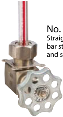
No. 125 Straight pattern - bar stock body and seat

These tubular glass gage cocks represent years of experience in the manufacture of gage cocks and offer a variety of types and connections to suit all requirements.