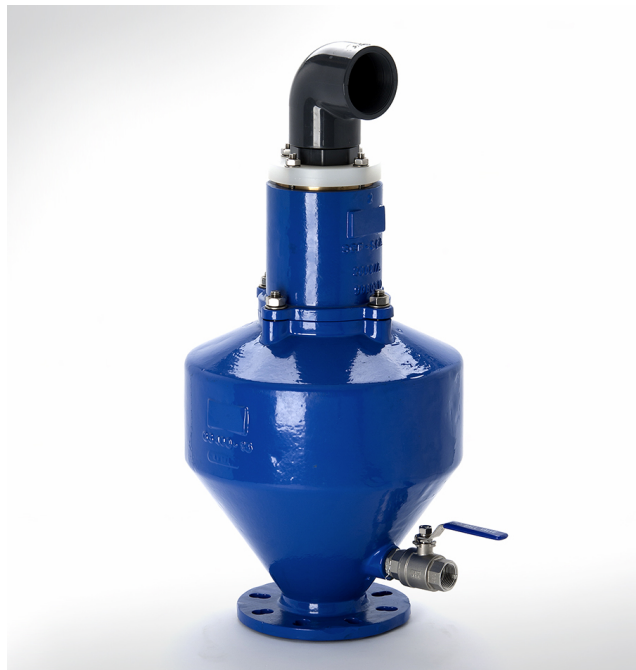
Air Flow Rate [m 3 /h] at 0°C, 1013 mbar, Nominal Pressure PN for standard design

Operating instructions, know how and safety instructions must be observed. The pressure has always been indicated as overpressure. We reserve the right to alter technical specifications without notice.