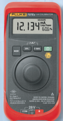
Fluke 707Ex Loop Calibrator