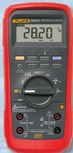
Fluke 28II Ex True-rms Industrial Multimeter