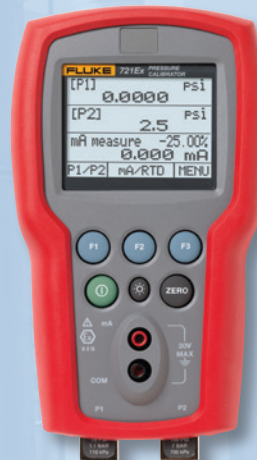
Fluke 721Ex Precision Pressure Calibrator