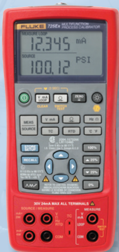
Fluke 725Ex Multifunction Process Calibrator

Fluke offers the widest range of reliable, accurate and intrinsically safe test tools. Including true-rms multimeters, infrared thermometers, process calibrators, pressure calibrators, loop calibrators and precision pressure test gauges.