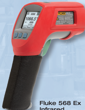
Fluke 568 Ex Infrared Thermometer