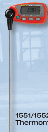
1551/1552 "Stik" Thermometers