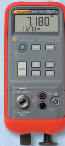
Fluke 718Ex Pressure Calibrator