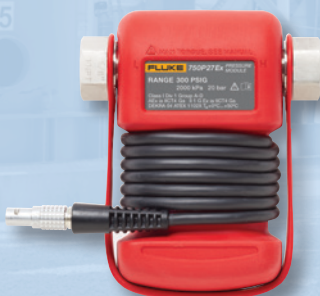
Fluke 750PEX Pressure Modules