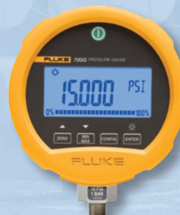
700G Series Precision Pressure Test Gauges