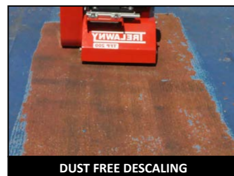
DUST FREE DESCALING