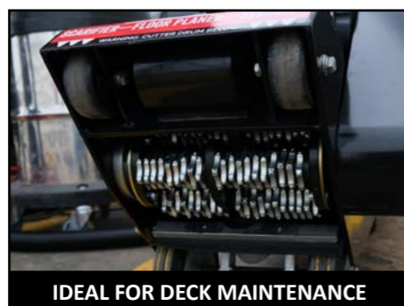
IDEAL FOR DECK MAINTENANCE